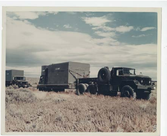
Figure 1.- Truck-mounted ML-1 reactor at the Idaho National Test Station.

Early in 1960s, the United States and the Soviet Union began to develop in collaboration mobile uranium thermal power plants (commonly called Mobile Nuclear Reactor Power Plants, MNRPs) that were equipped with small modular reactors. The primary objective was to integrate them into the new nuclear power programmes as autonomous electrical power systems, which would act