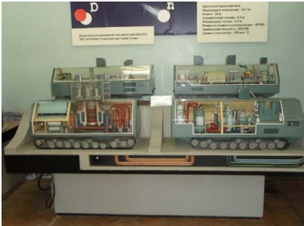
Figure 2.- Mock-up of a mobile nuclear power plant at the Moscow State Polytechnic Museum.

The American ML-1 and the Soviet TES-3 were the beginning of small modular reactors to be included in future programmes. They could travel on all types of transporters: ships, planes, trains and trucks, over rough terrain that does not allow the use of conventional power supply systems. Once installed, the plant was fully operational after about twelve hours. ML-1, equipped with a gas-cooled reactor (GCRE), was included in the US Army Nuclear Power Program and could generate power equivalent to burning 1.5 million litres of gasoline. However, due to initial mechanical problems with cooling, faulty sensor readings and other problems, the programme was shut down in 1965.