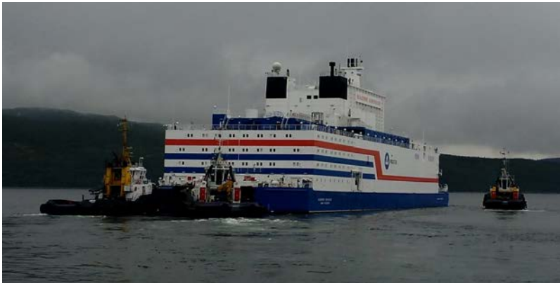
Figure 5.- The floating nuclear power plant Akademik Lomonosov being towed to the Chukotka district in 2019.

1-5 MW SMR, with new scientific and technological advances, intrinsically safe and capable of withstanding external attacks while requiring a smaller exclusion zone. It is likely to be operational by the end of 2023 and tested in 2024. According to the SCO Director, the large-scale production of a Generation IV nuclear reactor will have significant geopolitical implications for the United States. "The Pele Project offers a unique opportunity to further advance energy resilience, reduce CO2 emissions, while increasing nuclear safety and non-proliferation standards at advanced reactors around the world," he said.